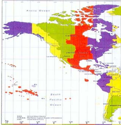
Standard Time Zones of the World

The International Ombudsman is a collective body made up of Ombudsmen, to whom any citizens can apply for any case of maladministration. The International Ombudsman will send the case to the local competent Ombudsman, otherwise it will act directly. The International Ombudsman promotes the Ombudsman institution in every country. The International Ombudsman, whose members are only Ombudsmen, co-operates with every institution involved in the citizen's protection. The International Ombudsman safeguards the "Ombudsman" denomination.